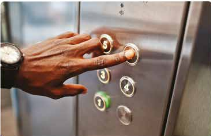
HIGH SPEED LIFTS