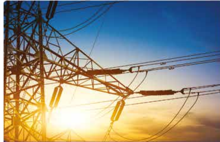
FULL BACKUP GENERATOR