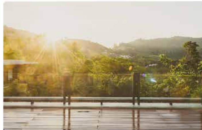
VIEWS INTO THE GREEN